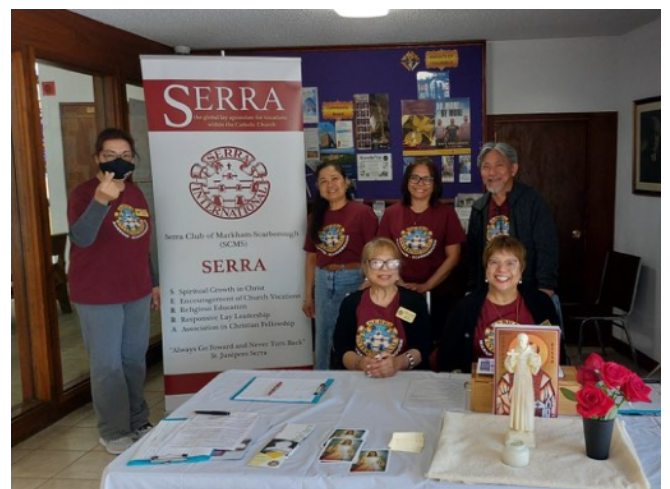
Vocation Chalice & Membership Drive at Precious Blood Parish, May 11