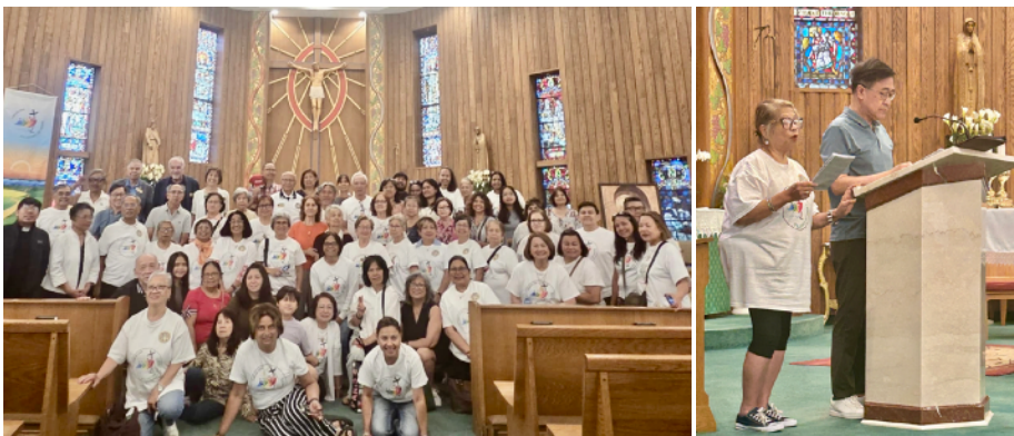
St. Edward the Confessor: Serrans, Priests, and Guests