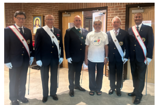
St. Barnabas: Serrans, Knights of Columbus