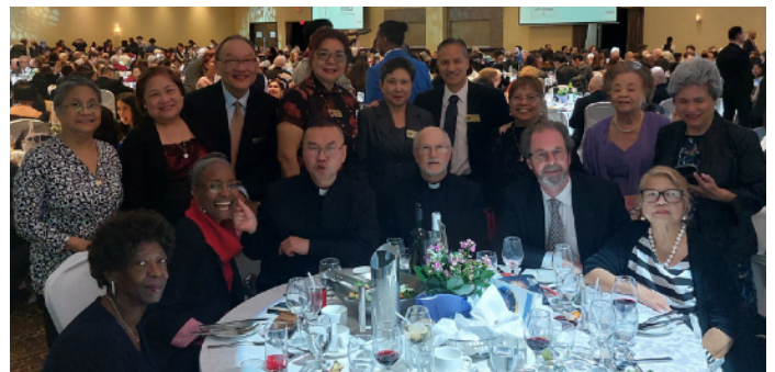
35th Annual Ordinandi Dinner, March 18