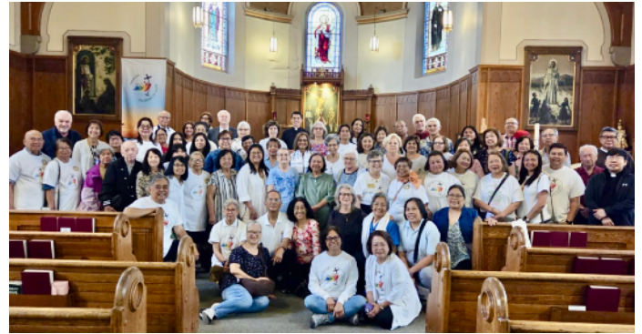
St. Gregory the Great: Serrans, Priests, and Guests

The celebration began with praise and worship, then with the Rosary for Vocations, followed by the Holy Mass for Vocations, and concluded with Eucharistic Adoration for Vocations. Together, we lifted our prayers and thanksgiving, grateful for the Lord's presence on this Spirit-filled pilgrims of hope journey.