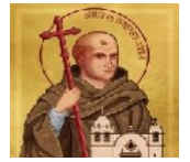
St. Junipero Serra