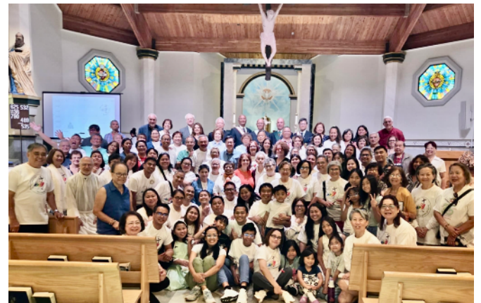
St. Barnabas: Serrans, Priests, and Guests